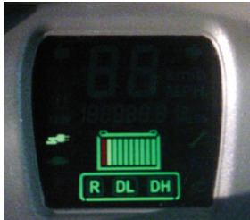
Plugged In Charging

After charging is 100% complete, the Charger Connected icon will be the only thing lit and the bar graph will not be illuminated. A green light on the charger itself will also illuminate when the car is 100% charged. To know if the charging process is complete, all ten bars on the State of Charge Indicator should be illuminated when the car is turned on. If neither the Charger Connected icon nor the State of Charge Indicators are illuminated, the charger may not be charging. If this occurs, make sure the Main Disconnect Switch is in the ON position. More information on the charger and charging of the batteries is discussed on pages 76-81 of the Owner's Manual.